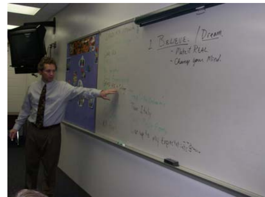
Mentors with Strive Class of 2009